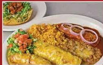
Santa Fe Sampler

Fiesta Combo Smothered bean burrito, chili relleno & a beef taco. Served with refried beans & Spanish rice. 11.49