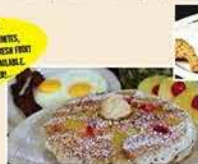
Pineapple Upside Down Pancakes

FTY CHOICES: HEALTHIER OPTIONS: EGG WHITES, TURKEY SAUSAGE, SEASONAL FRESH FRUIT & PEEL UP! SLICES ARE AVAILABLE. JUST ASK YOUR SERVER!