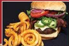
Loaded Jalapeño Bacon Burger

Italian Sausage Sandwich Spicy Italian sausage & Swiss cheese on a toasted hoagie, served with marinara sauce. 9.69