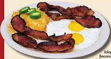
Jalapeño Baconator & Eggs

Country Fried Steak* Breaded chuck steak covered in country gravy. 9.49